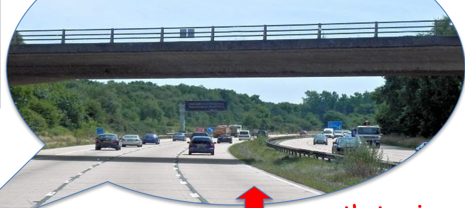
M27 section at West End